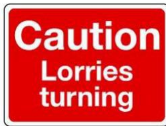
Plate 3-2: Example of Proposed Warning Signage for Public Highway

3.4.2 The appointed EPC Contractor(s) will ensure that all works within streets will have all required signage and traffic management measures in place to ensure the safety of workers and all other road users. These measures will be confirmed in the Final CTMP(s).